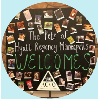
Welcome sign from the staff at the hotel. Cool!!