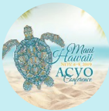
See you all next year in Hawaii